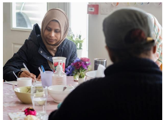
Clockwise from top right: Bright Box; Cook4Care; Home-Start Parenting Café; thank you letter from school pupil

I am writing to say thank you for working in a charity and helping people in need. Just so you know, people in need, and every one else, really appreciate what you are doing. We have been thinking about how helpful and grateful everyone is, and one more time THANK YOU! ♥ YOU ROCK ♥