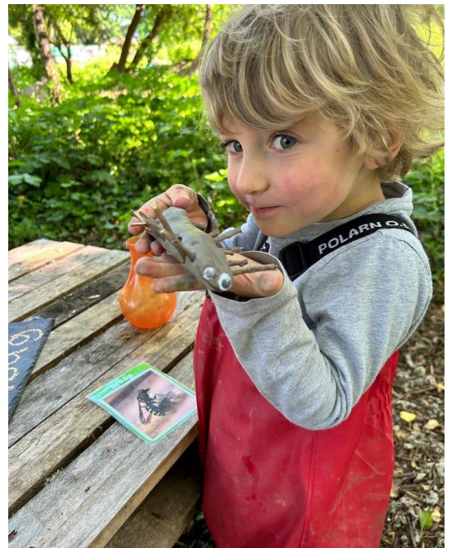
Above: Rewilding Forest School at Home Farm Allotment Left: Community Allotment Project