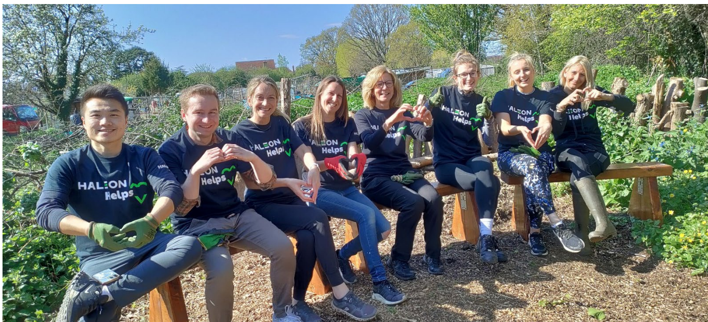
Corporate volunteering at the Tree Canopy Project

We are registered with the Fundraising Regulator.